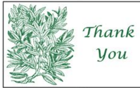
Item # CD2