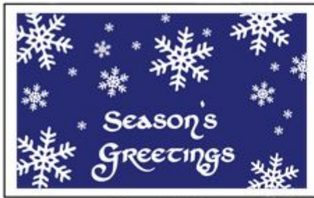
Item # CD1