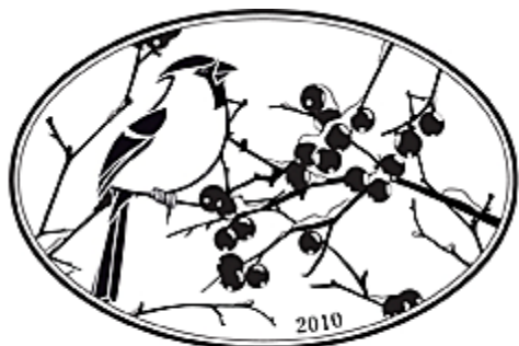
“A Winter’s Rest”