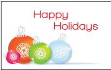
Item # CD3